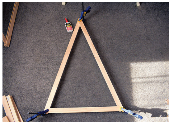
Tools you will need to create this:

DAP RapidFuse Wood Adhesive Clamps Drill or hammer and nail if you want to add hooks (6) 3/8" x 2" x 3' craft boards - $1.85 ea. (3) 3/8" x 2" x 2' craft boards - $1.32 ea. 7/8" brass cup hooks optional